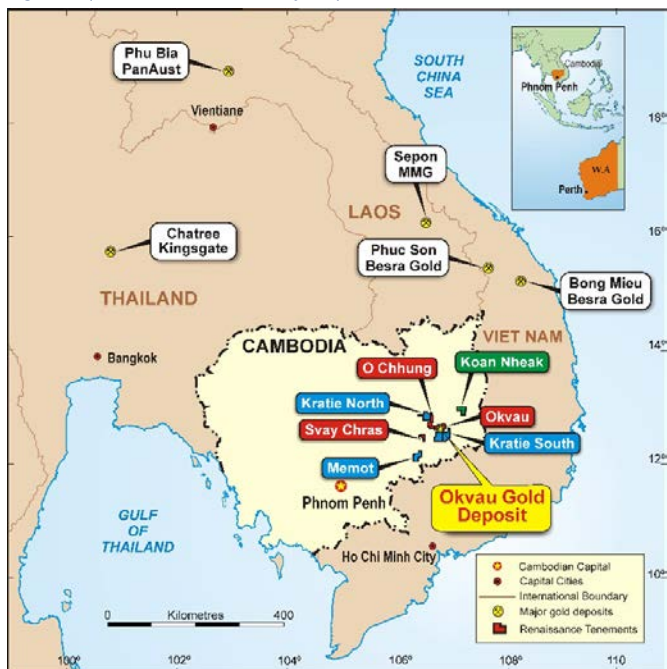
Figure 1 | Cambodian Gold Project | Location